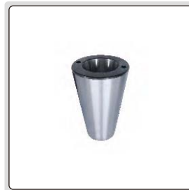
BT50/BT40 converter (optional)