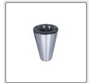
BT50/BT30 converter (optional)