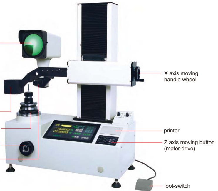
X axis moving handle wheel