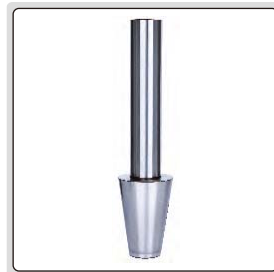
standard rod (included)